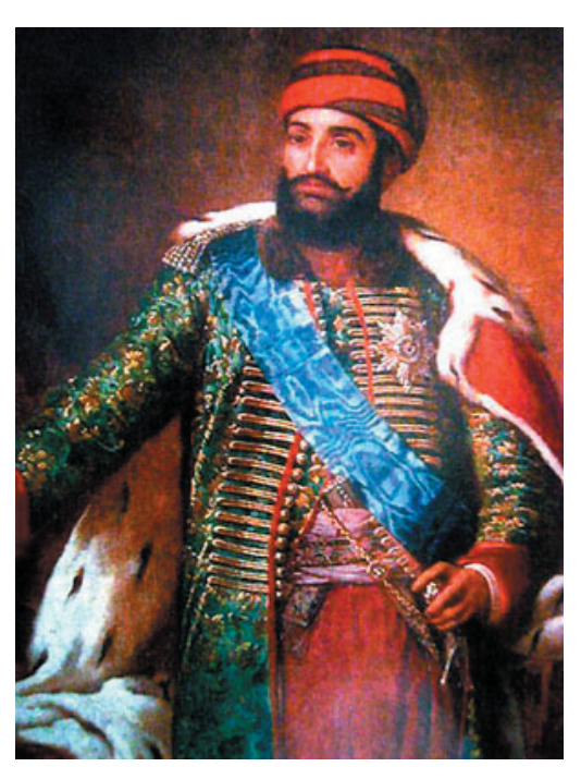
King Erekle II of Georgia

Ning Erekle II was famous for his bravery and smartness in politics not only in Transcaucasia, but also in Europe. Frederick the Great was rather more realistic when he summed up the leading military figures of his age as "Moi en Europe, et en Asie l'invincible Hercule, roi de Georgie (In Europe I am invincible, but in Asia it is the unconquerable Hercules, the King of Georgia, Irakli II) (A Modern History of Georgia, D.M.Lang, London 1962, p. 583).